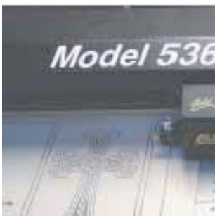
Gold Touch™ Cutting Head

"...the preferred system for precision cutting sandblast stencil "