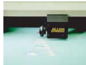
Sandblast Stencil Cutting